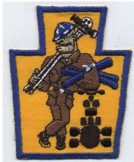
56 Civil Engineering Squadron patch